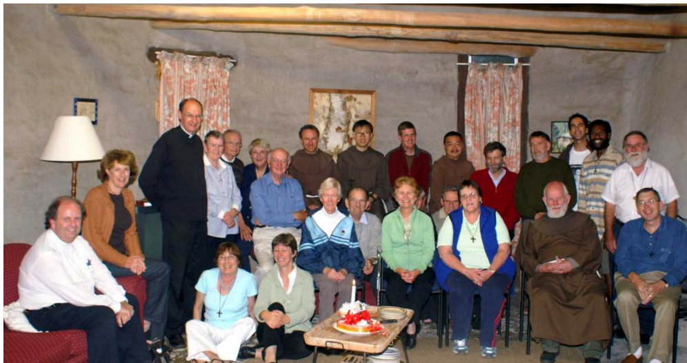
Chapter and other Tertiaries in the Community Room at the Stroud Monastery

You will receive election papers in the next few weeks. Please give this your prayerful consideration.