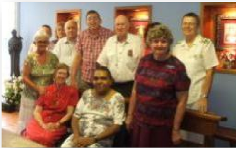
Townsville Tertiaries from Qld-A in the Mission to Seafarers' Chapel

Christ is risen indeed. Alleluia! It is a joy to greet you in the brightness of the Easter season. I hope you were able to celebrate our Lord's Resurrection appropriately with the Lord's family. Australian poet James McAuley's hymn sings the Easter spirit.